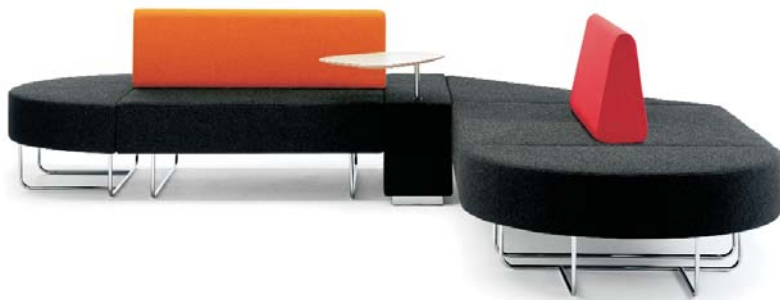
Boundary Sofa Unit - Key Materials by WEIGHT

Our footprint analysis indicates that over 90% of a products environmental impact is down to the raw materials used in manufacture. By understanding the footprint of different materials, we can make better decisions on material selection for forthcoming products.